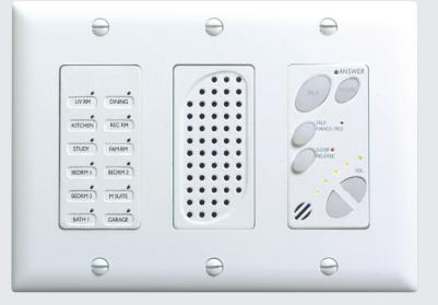
Intercom Main Console (IC1002-XX)

Built on Cat 5 cabling, the Broadcast Intercom System includes easy installation features such as convenient RJ45 connections.