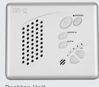
Desktop Unit (F9018-XX)