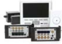
CM5451-WH Ball Camera and LCD Kit