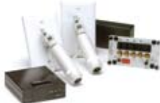
CM7644 Cat 5 Color Camera Kit