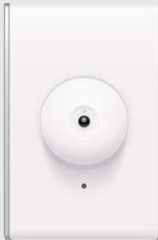
Ball Camera (CM5002-XX)

Built on Cat 5 cabling, the On-Q Camera System includes easy installation features such as convenient RJ45 connections.