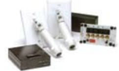
CM7645 Cat 5 Black and White Camera Kit