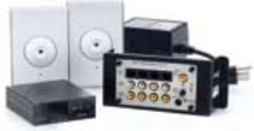
CM7646 Ball Camera Kit